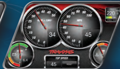
Telemetry Sensors Installed View speed, RPM, temperature, and voltage data on the Traxxas Link dashboard