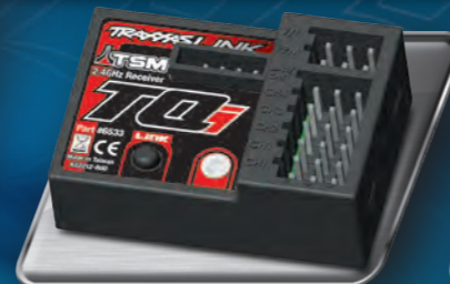
5-Channel Receiver With 3 Telemetry Ports with Traxxas Stability Management™