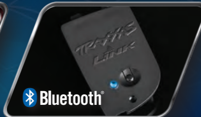
Traxxas Link™ Wireless Module connects with your iPhone, iPad, iPod touch, or Android*